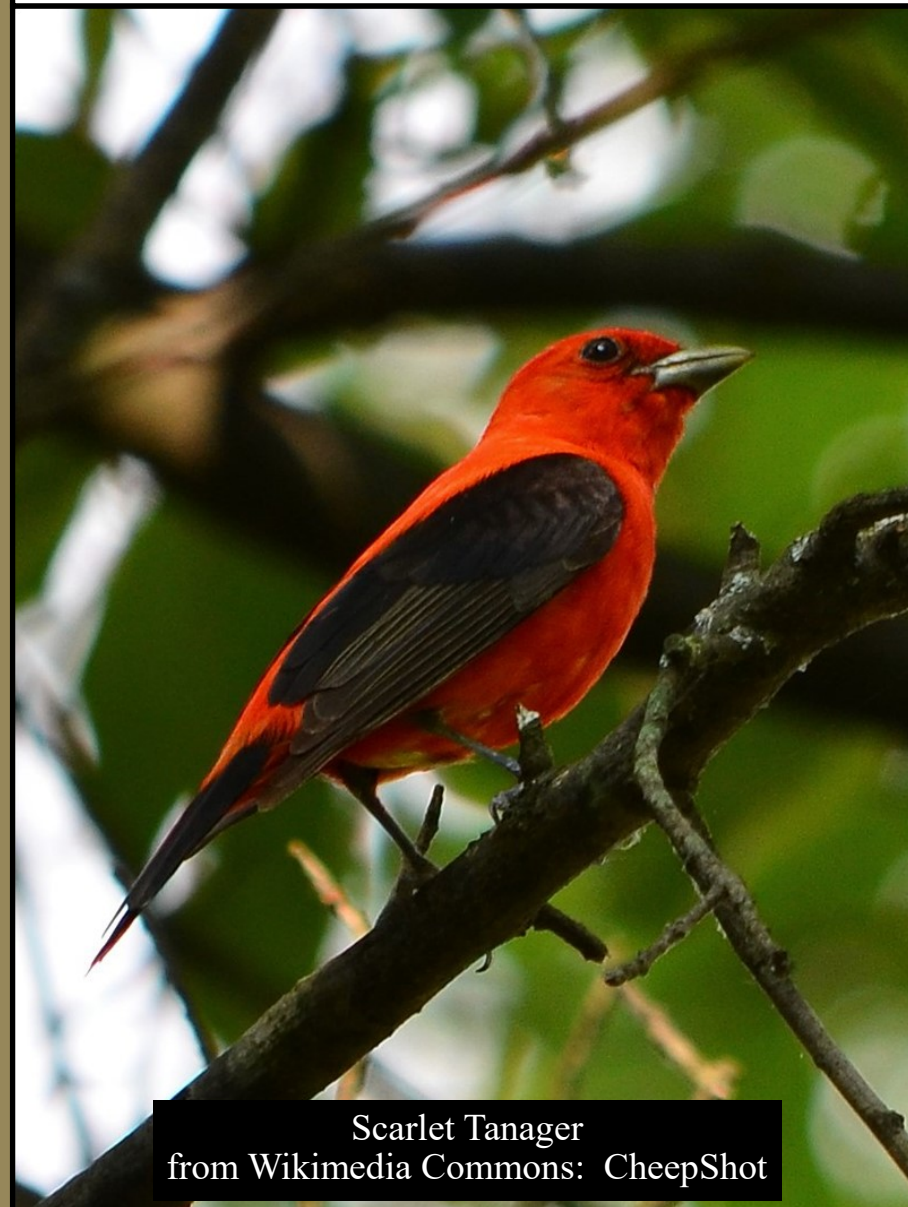
Scarlet Tanager