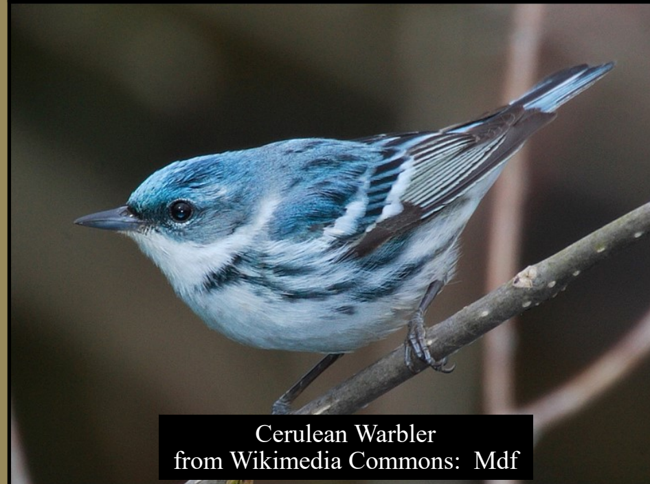
Cerulean Warbler