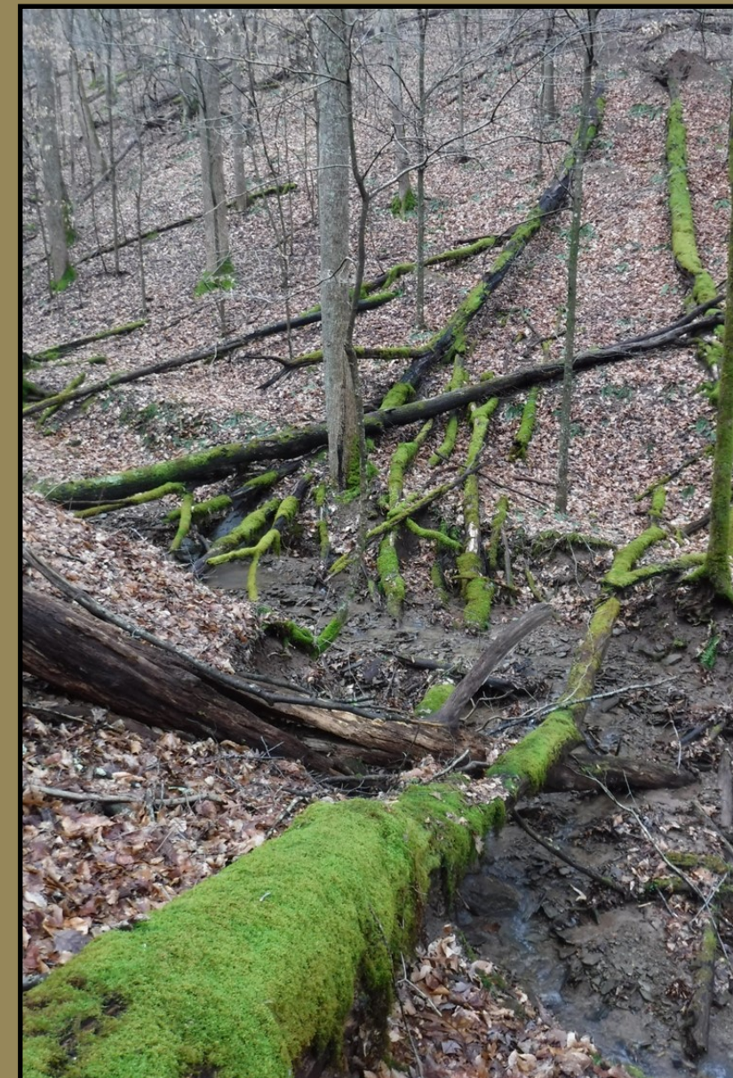
Aged blowdowns, 100% leaf cover, clean water.