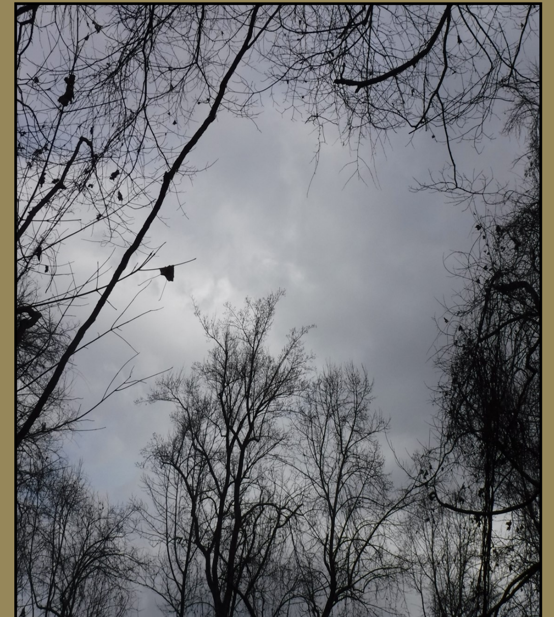
Canopy gaps, due to snags and blowdowns lead to...