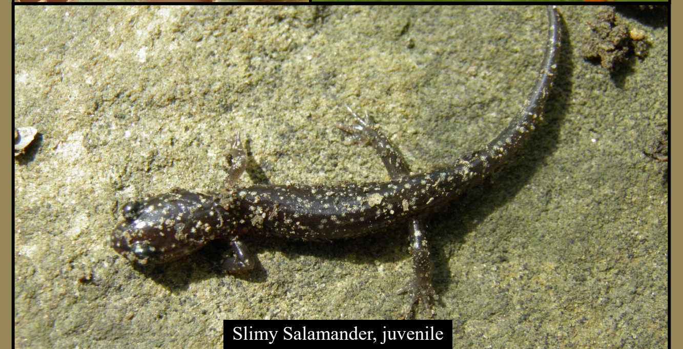
Slimy Salamander, juvenile