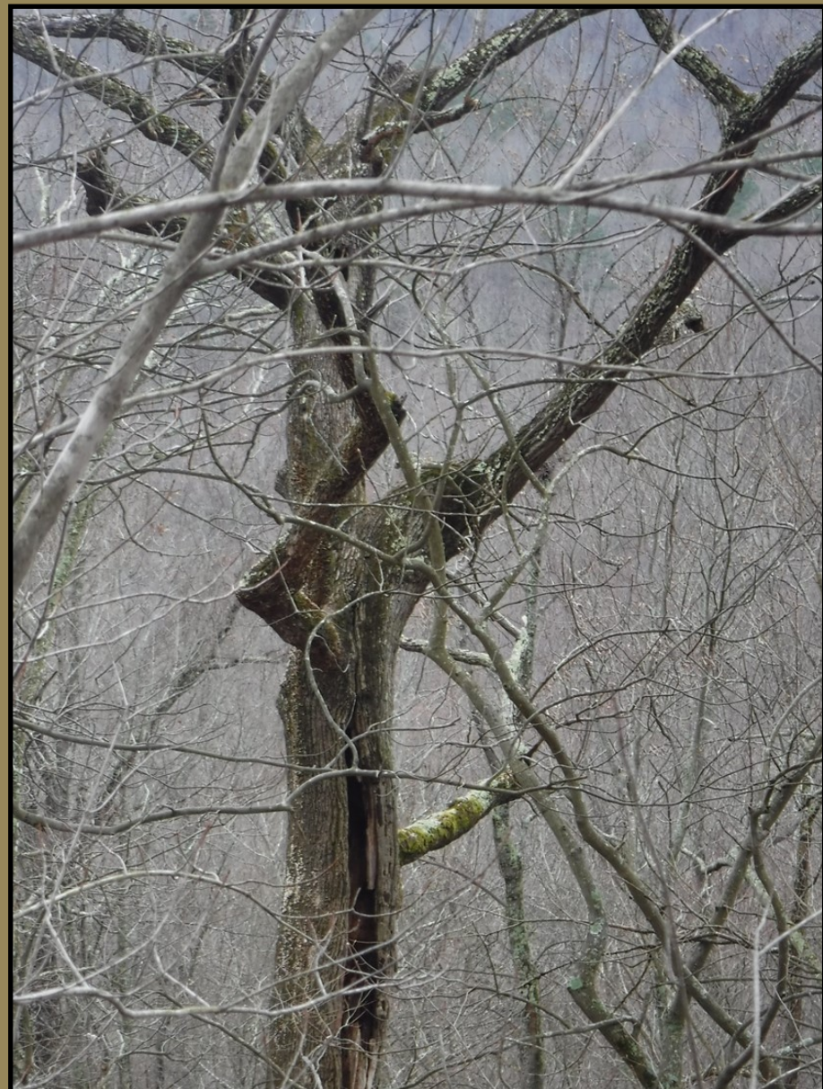
Many "stag-headed" and hollow trees.