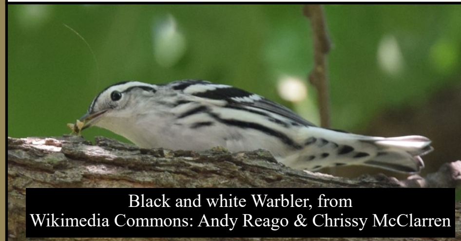
Black and white Warbler